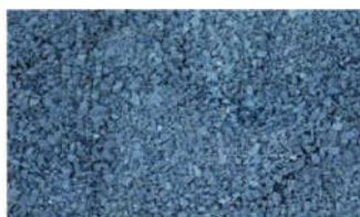
Fig .2 Fine Aggregate

The other sort of mixtures are those particles passing the 9.5 metric linear unit (3/8 in.) sieve, nearly entirely passing the 4.75 mm (No. 4) sieve, associate degreed preponderantly preserved on the seventy five \mu\text{m} (No. 200) sieve are known as fine aggregate. For enlarged workability and for economy as mirrored by use of less cement, the fine aggregate ought to have a rounded shape. the aim of the fine aggregate is to fill the voids within the coarse aggregate and to act as a workability agent In concrete, an mixture is hired for its economic system factor, to reduce any cracks and most importantly to deliver energy to the structure. they're shown in fig.2