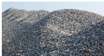
Fig.1 Coarse Aggregate

Coarse-grained mixtures won't tolerate a sieve with 4seventy five metric linear unit openings..Those particles that are preponderantly preserved on the 4.75 mm sieve and can pass through 3-inch screen, are referred to as coarse aggregate. The coarser the aggregate, the additional economical the mix. Larger items provide less area of the particles than identical volume of tiny pieces. Use of the biggest permissible maximum size of coarse aggregate permits a discount in cement and water requirements. exploitation aggregates larger than the utmost size of coarse aggregates permissible may end up in interlock and type arches or obstructions inside a concrete form. that enables the world below to become a void, or at best, to become crammed with finer particles of sand and cement solely and results during a weakened area. they're shown in fig.1 For Coarse Aggregates in Roads following properties are desirable Strength