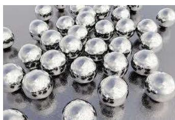
Fig 5 : Silver Nanoparticles

The researchers located that silver nanoparticles had a damaging end result on cells, suppressing cell increase and multiplication and causing necrobiosis relying on concentrations and duration of exposure. In particular, the two hundred nm silver debris brought on a concentration-structured boom in DNA harm within side the human cells.